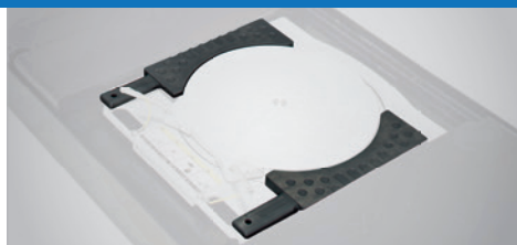
Paddle kit for premium turntable