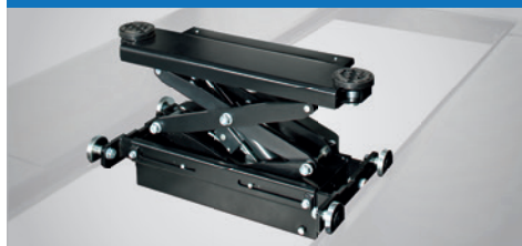
Jack for quattrolift