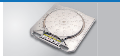
Premium turntable kit

EMEA-JA Snap-on Equipment s.r.l. - Via Prov. Carpi, 33 - 42015 Correggio (RE) Phone: +39 0522 733-411 - Fax: +39 0522 733-479