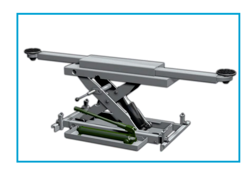
AXLE JACK OSI XT250H

Axle jacks with a lifting capacity of 2500 kg ◆ hand lever hydraulic pump ◆ adjustable shoulder spacing ◆ mechanical height lock ◆ points of support with smooth height adjustment.